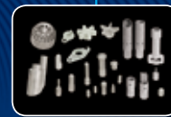
PARTS & SERVICE